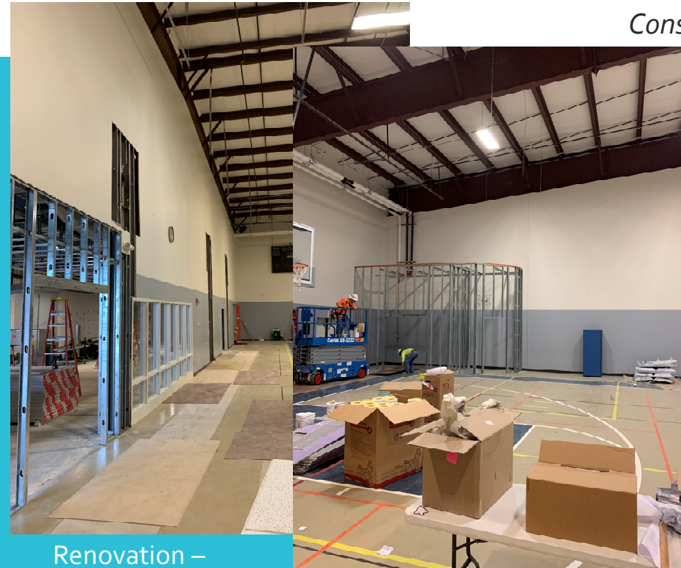
Renovation – The beams in the gym are gone and the storage room is framed