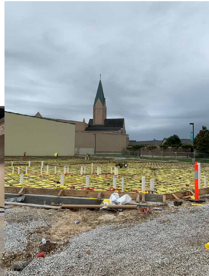
Building Slab is ready to pour concrete